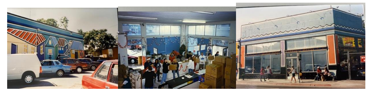
803 South First Street muralsSouth First Street from 1st Street