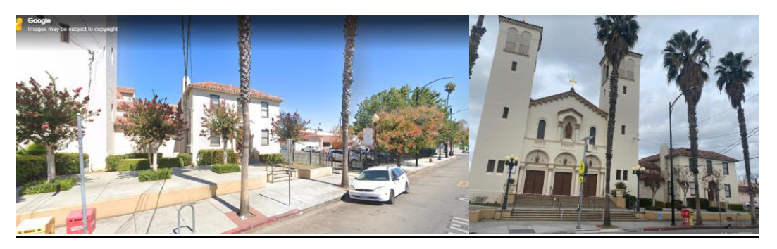
Buildings at Sacred Heart Parish in San Jose